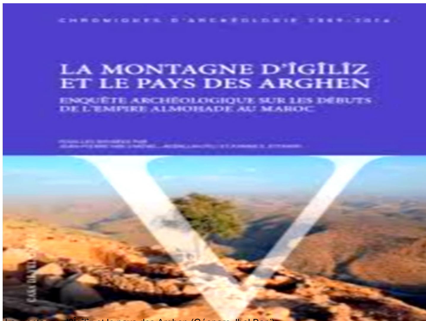
La montagne d'Igîlîz et le pays des Arghen (Géoparc Jbel Bani)